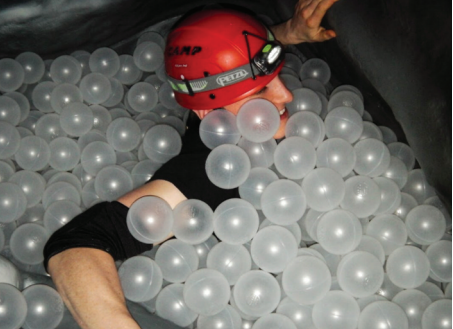
The artificial cave system would have a ball pit to simulate a flooded passageway