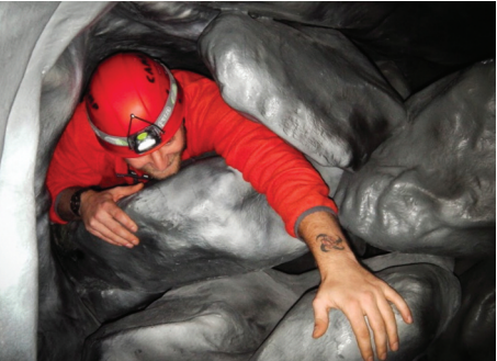
The tunnels would include tight passages through boulders

It's incredible when I think of all the different adventurous activities he enjoyed in his life. There was always an element of risk and as a younger man he put himself in some crazy situations. Yet something went wrong in what was a relatively controlled situation.